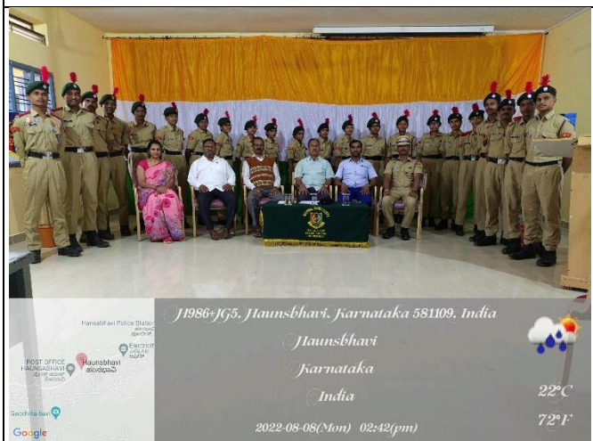
Final Year NCC Cadets Team