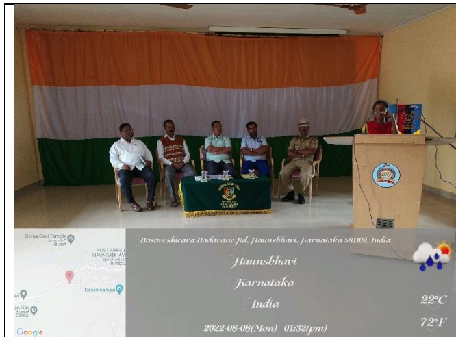
Prayer Song by Keerti